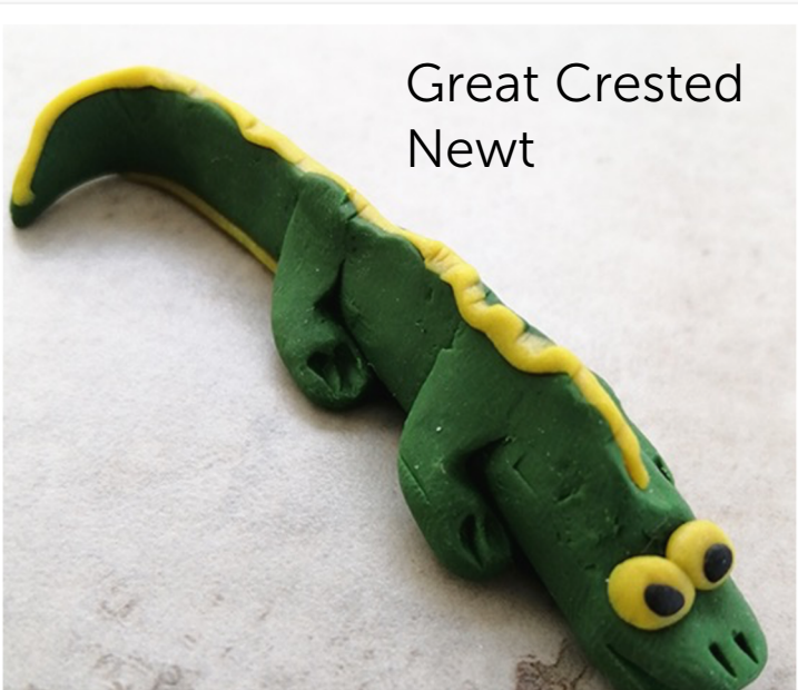
Great Crested Newt