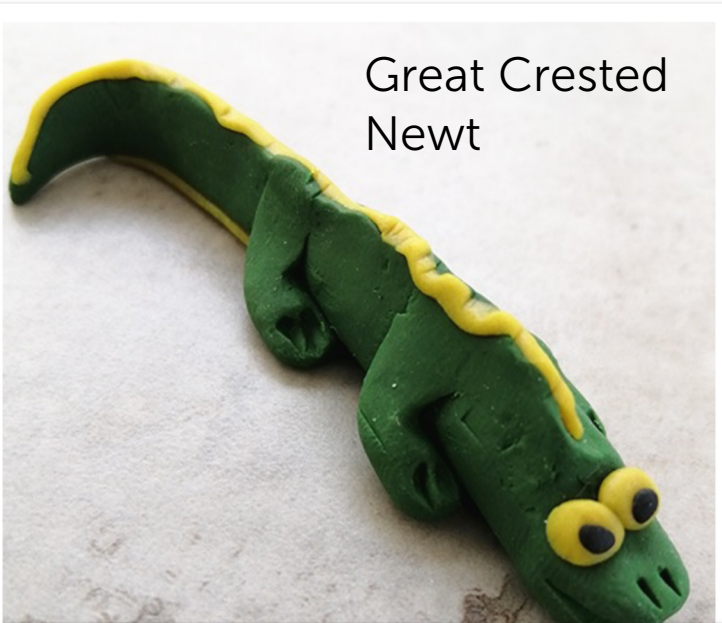
Great Crested Newt